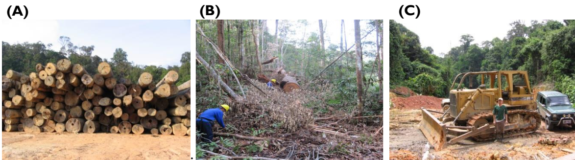
Figure 1. Emissions from selective logging operations in the Forest Management Calculator include: (A) emissions from timber extracted (minus a portion that ends up stored in long-term wood products), (B) emissions from incidental damage to surrounding trees, and (C) emissions from the creation of logging roads, skid trails and landing decks.

Note: All terms are expressed in biomass carbon (t CO 2 )